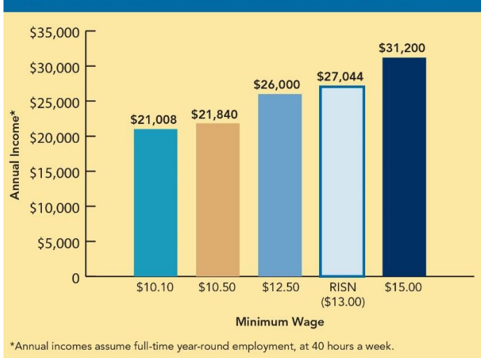
RAISING THE RHODE ISLAND MINIMUM WAGE TO $15.00 WOULD HELP WORKERS MEET BASIC NEEDS

Minimum wage earners are not able to meet their basic needs. According to the recent 2018 Rhode Island Standard of Need , 1 a study that documents the cost of living in the Ocean State, a minimum wage earner – working 40 hours a week, year-round – would earn $21,842 at Rhode Island’s current minimum wage of $10.50/hour, just over $5,200 a year less than the Rhode Island Standard of Need amount for a single adult, as shown in the chart. The thousands of Rhode Island families that have a bread-winner earning the minimum wage face an even more formidable gap between their earnings and the cost of basic needs in Rhode Island.