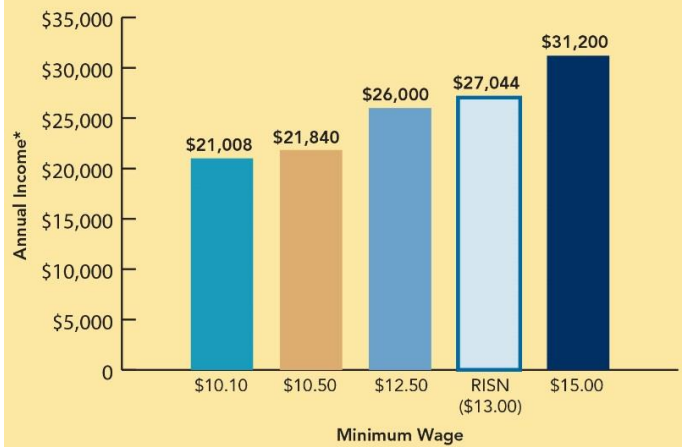
RAISING THE RHODE ISLAND MINIMUM WAGE TO $15.00 WOULD HELP WORKERS MEET BASIC NEEDS

*Annual incomes assume full-time year-round employment, at 40 hours a week.